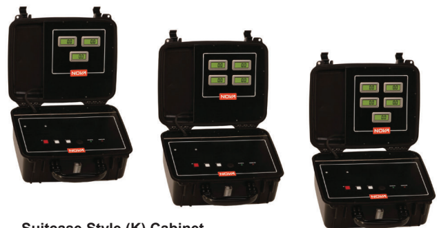
Suitcase Style (K) Cabinet