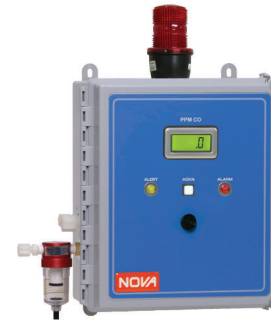
580P - Pump Style in NEMA 12 Enclosure (models shown with optional strobe light)