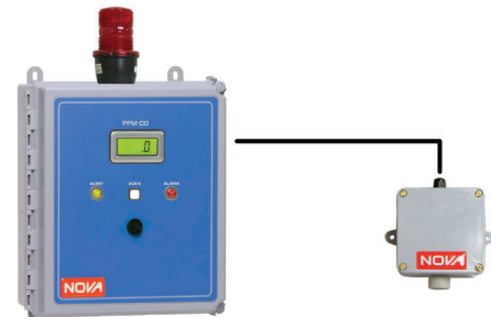
580DR1 - Alarm Unit and Single Diffusion-Style Sensor in Separate Enclosures